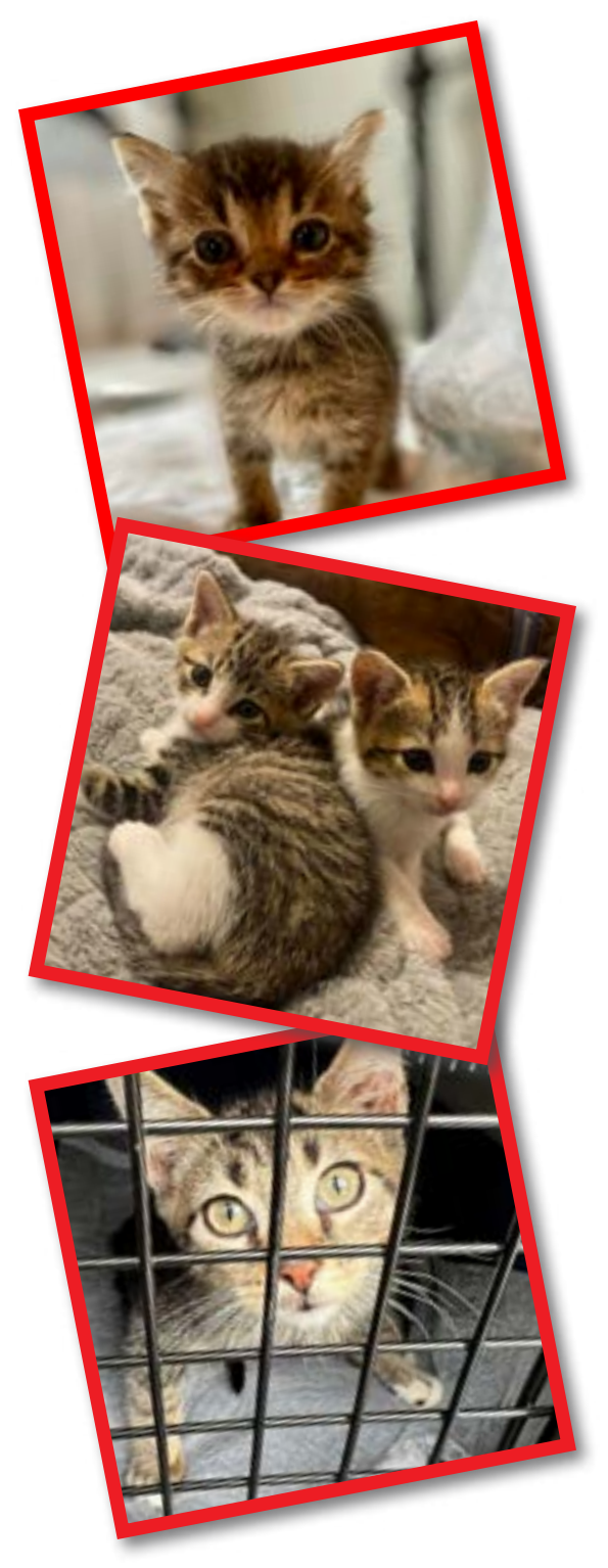
These cats found their forever homes through AKP.